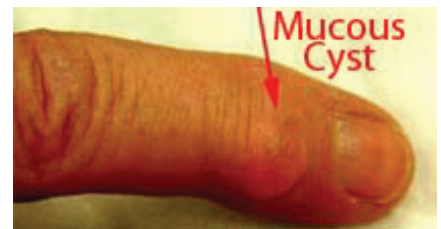
A mucous cyst at the end of the index finger.